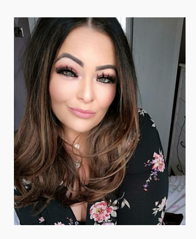
@thebeautyedit__ Beauty & Style