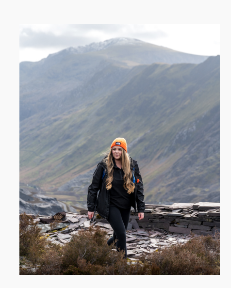
@ s a m s_a d v e n t u r e s_x Travel, Outdoors & Well-being