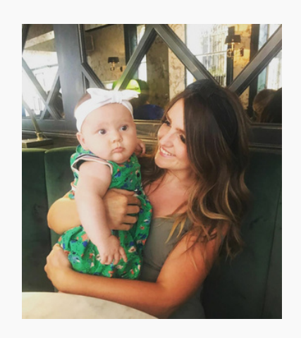
@scarletwonderland Lifestyle, Wellness & Family